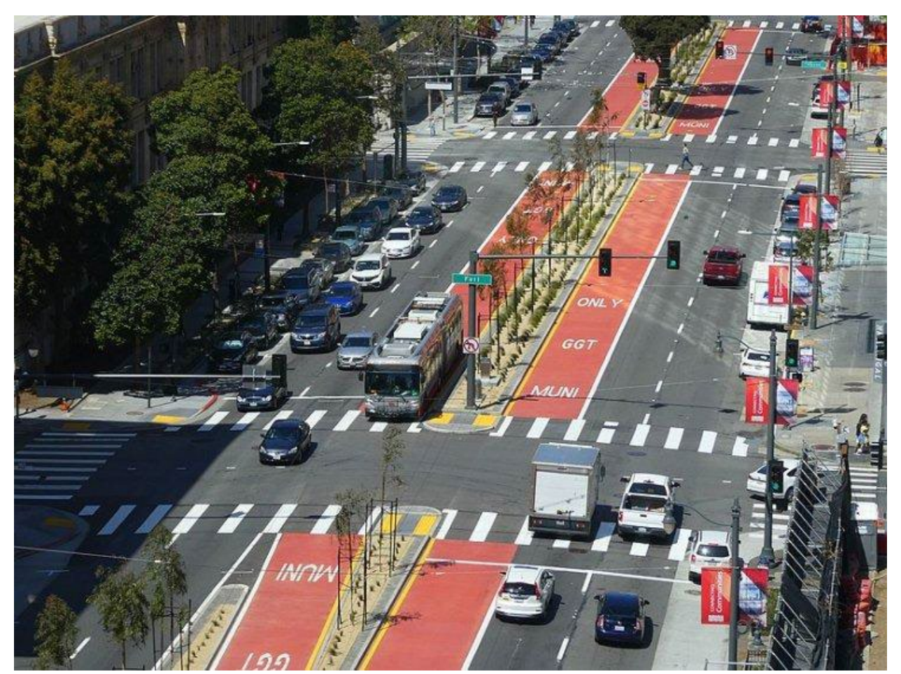
Van Ness Avenue, San Francisco

collection.<sup>2</sup> There is no one-size-fits-all approach to BRT and a University Avenue BRT is sure to look different than it might on Telegraph Avenue or International Boulevard in Oakland. However, pursuit of a quicker and more efficient bus corridor along University should result in dedicated bus lanes and elevated platforms at existing AC Transit stops. Most transit planners consider center running bus lanes--such as provided on International Boulevard and Van Ness Avenue in San Francisco--as more effective than curbside bus lanes. However, this would have to be determined in the course of planning the project. Relative to other rapid transit improvements such as light rail, BRT's advantages include lower upfront capital requirements, a higher degree of flexibility in their application, and a much quicker implementation timeline.<sup>3</sup>