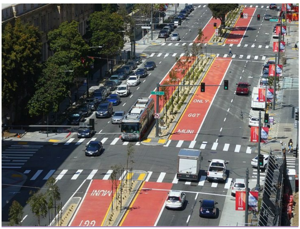
Van Ness Avenue, San Francisco Do we want to include a photo? Van Ness Ave is probably the best example - it is designed to work with multiple existing bus lines using regular buses