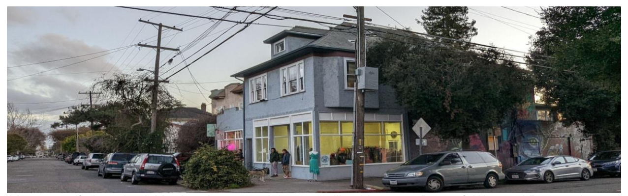
Many grandfathered neighborhood commercial spaces, like this one at Bancroft Way and Roosevelt Avenue, already thrive in Berkeley's neighborhoods and harness the City's historic resources to increase livability and economic opportunity.

Berkeley's neighborhoods supported neighborhood commercial units in the past—and they still support a select few grandfathered units that still remain, such as the neighborhood retail space shown below. As Berkeley's neighborhoods densify and more people continue working from home, the demand for nearby walkable access to groceries, coffee shops, daycares, and other amenities will only continue to grow.