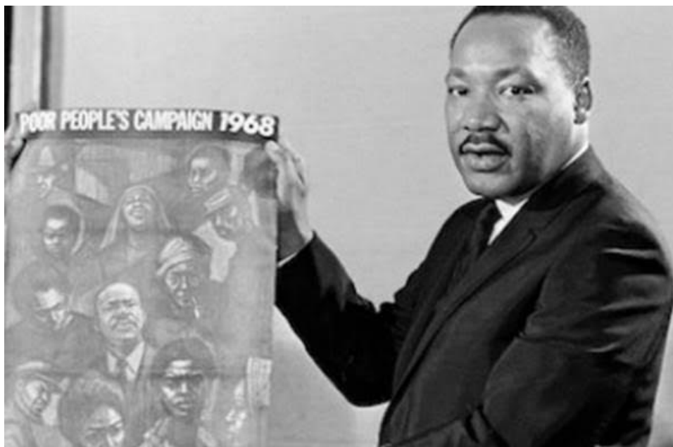
Dr. Martin Luther King, Jr. holding poster for 1968 Poor People's Campaign

Dear Oaklandish-area friends and colleagues,