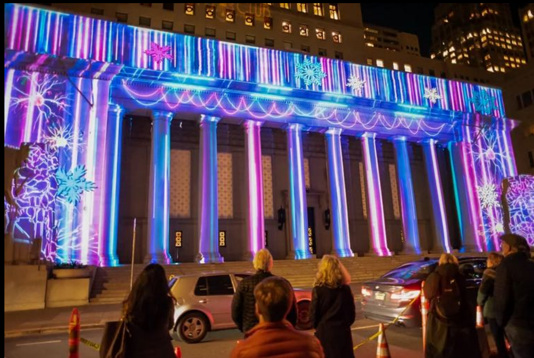
projection mapping, San Francisco

The artist we propose for this activation is profiled in more detail later in this proposal. His work is represented HERE . Video links provided HERE and HERE give more mapping examples.