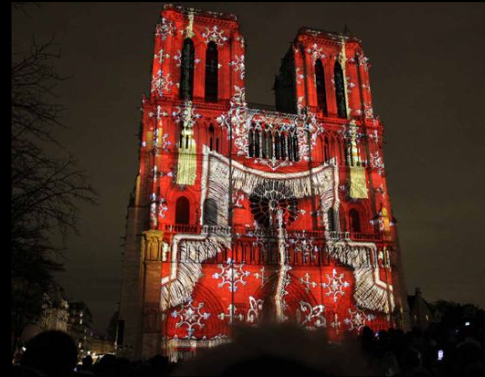
projection mapping, Notre-Dame de Paris

An artist with the requisite skills creates animations with an accompanying soundscape. The building seems to move and dance, to be deconstructed and put back together again. A wide variety of imagery and moods are achieved, and the exhibition repeats multiple times in an evening.