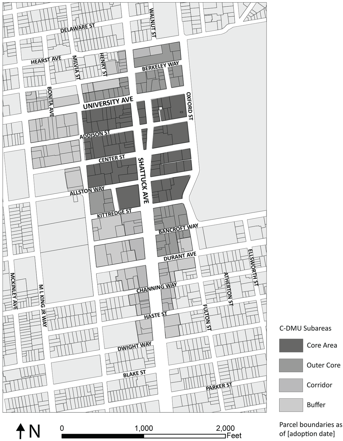
FIGURE 23.204-5: C-DMU SUB-AREAS