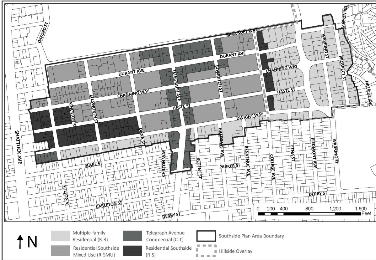
Exhibit A: Proposed Zoning Map – Southside Plan Area