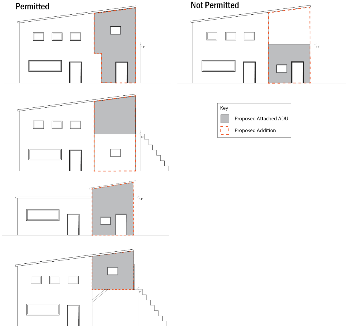
Figure 1 – Examples of Additions Over 14 ft. Containing Attached ADUs