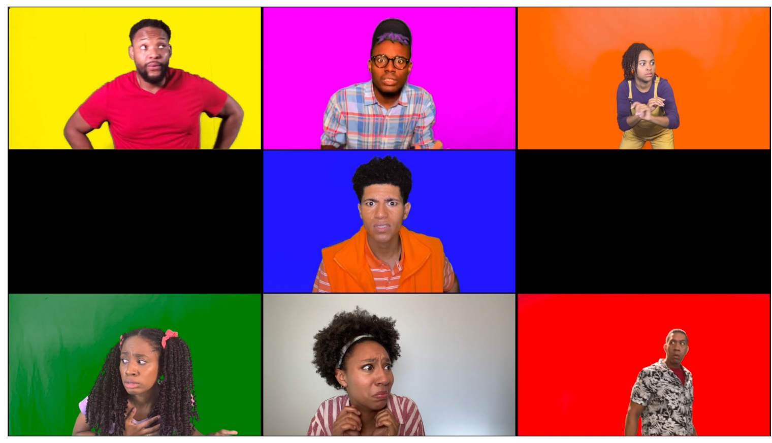
Bay Area Children's Theatre, FY22 Arts Organization Grantee