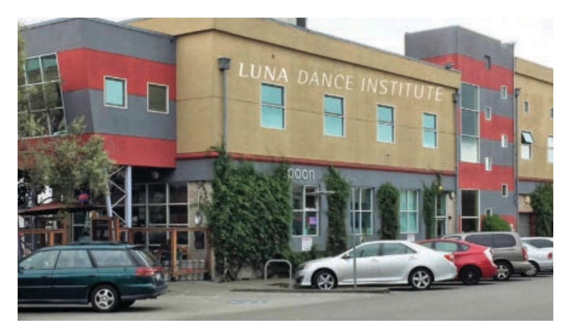
Luna Dance Center, new building supported in part by City of Berkeley

A project that helps maintain, improve, or adds to the organization's infrastructure. It results in an acquisition of a new asset or new construction, improvements, expansion, renovation, rehabilitation, repairs, or replacement of an existing facility and other infrastructure assets in the City of Berkeley.