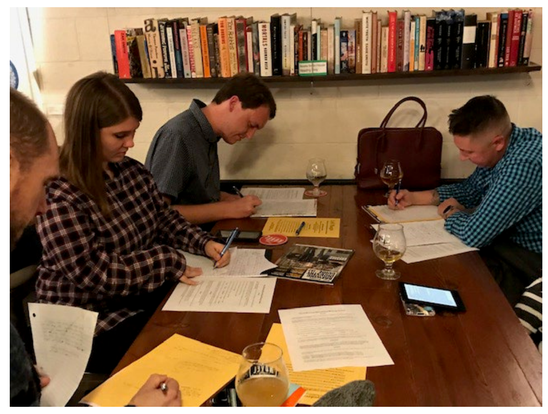
Left Margin LIT, FY22 Arts Organization Grantee