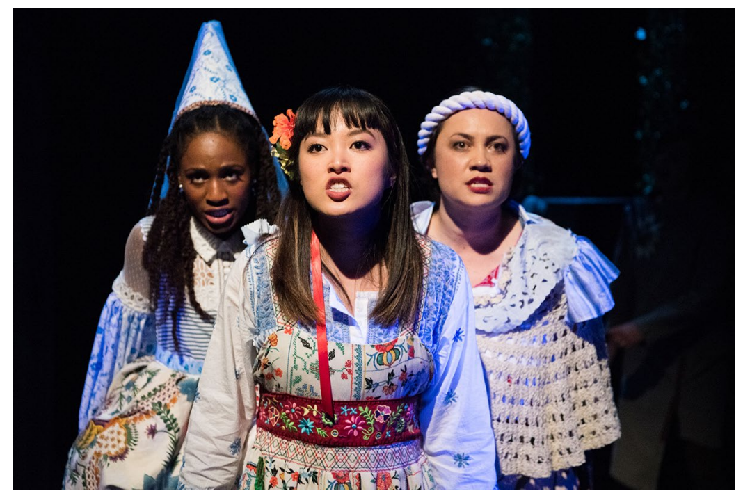
Shotgun Players, FY22 Arts Organization Grantee