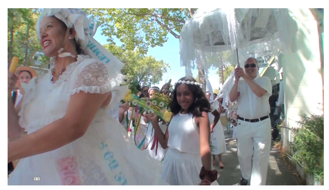
SF Bay Brazilian Day & Lavagem Festival, FY21 Festival Grantee