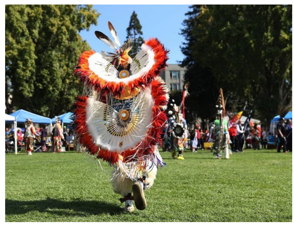
Annual Berkeley Indigenous Peoples Day Powwow & Indian Market, FY22 Festival Grantee

Cultural Equity Statement: The City of Berkeley Civic Arts program commits to equity within the arts and culture sector by consistently evaluating its programs and practices. The City recognizes the multiple benefits the arts provide, regardless of race, color, religion, age, disability, national origin, sex, sexual orientation and gender identity/expression.