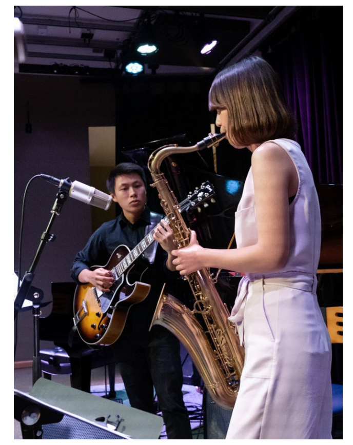
California Jazz Conservatory, FY22 Arts Organization Grantee