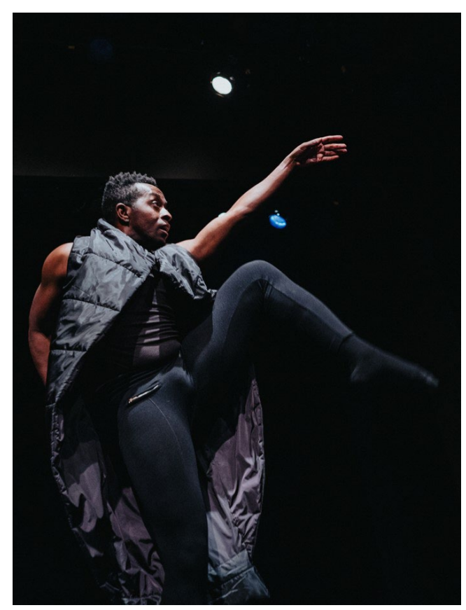
Queering Dance Festival, FY22 Festival Grantee

Funding for festivals and special events.