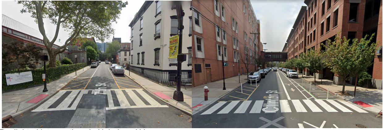
Daylighted intersections in Hoboken, NJ

prohibits any driver from parking within 25 feet of a crosswalk. Hoboken's progress has in part been due to their enthusiasm in actually enforcing the state rule.