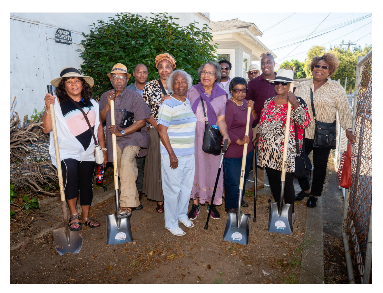
Ground Breaking Ceremony