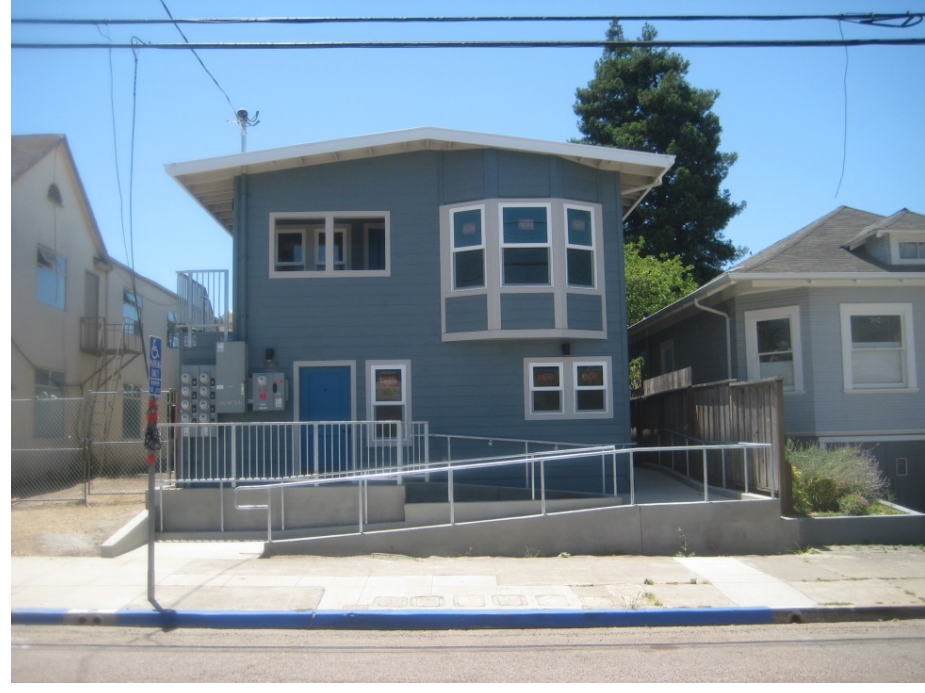
Construction Completed in July 8 low income households moved in by September