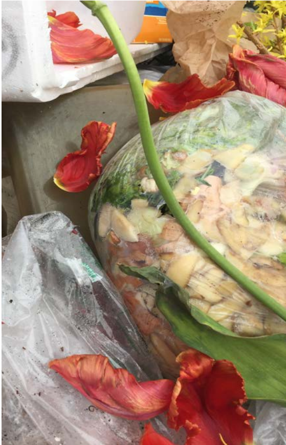
Example of organics in a Berkeley landfill bin