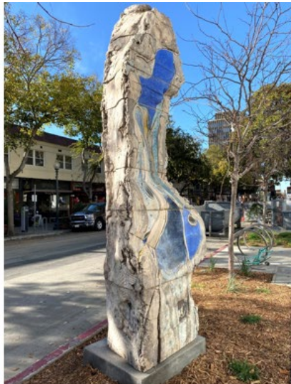
After installation in new location