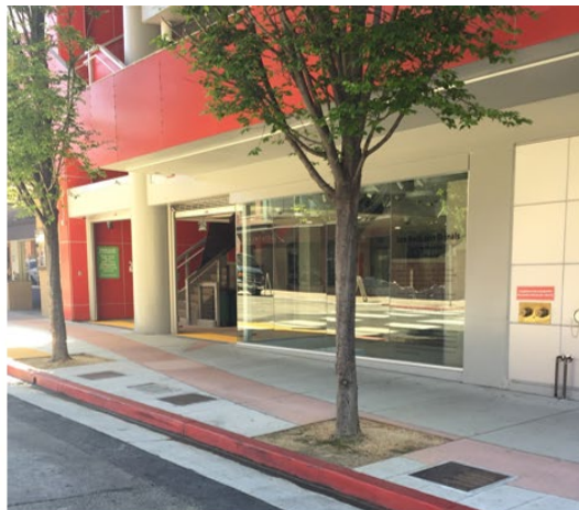
During construction & reinstallation—partial representation